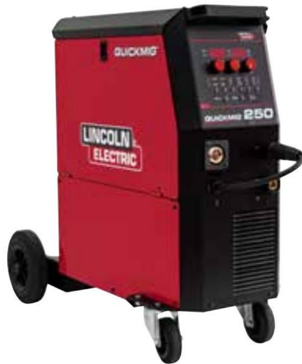
QUICKMIG® 250 250A@35%