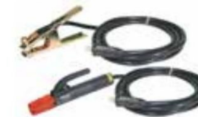
MMA KITS W000260683 W000011139