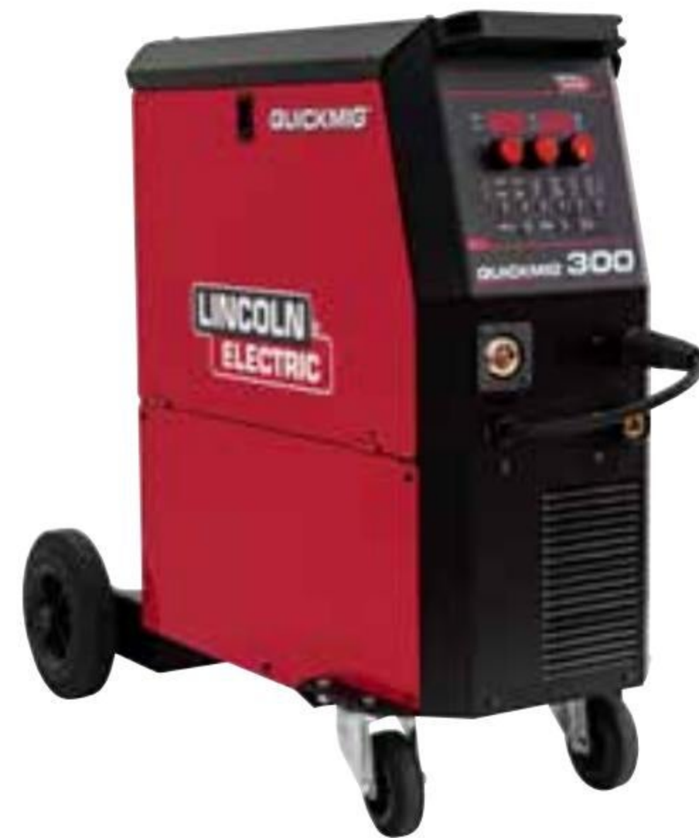
QUICKMIG® 300 300A@35%