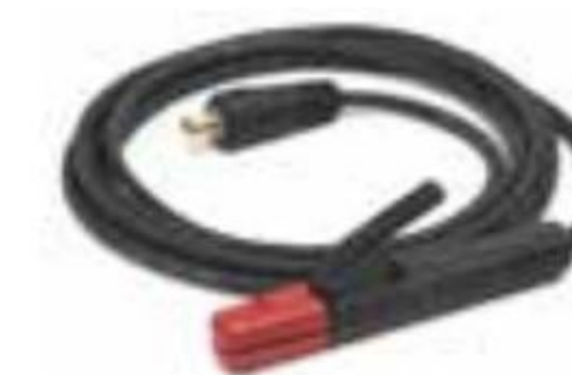
WELDING CABLE WITH ELECTRODE HOLDER E/H-300A-50-5M