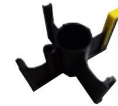
ADAPTER FOR SPOOL TYPE B300 K10158-1